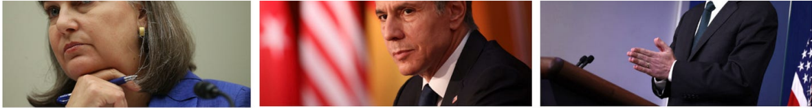
THE PLAYERS Left to right: Victoria Nuland, Anthony Blinken, and Jake Sullivan.

Over the next several meetings, the participants debated options for an attack. The Navy proposed using a newly commissioned submarine to assault the pipeline directly. The Air Force discussed dropping bombs with delayed fuses that could be set off remotely. The CIA argued that whatever was done, it would have to be covert. Everyone involved understood the stakes. “This is not kiddie stuff,” the source said. If the attack were traceable to the United States, “It’s an act of war.”